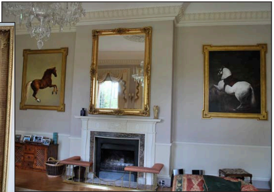
ABOVE: oil replicas of George Stubbs' 'Whistlejacket' and Diego Velazquez's 'A White Horse' in situ by and courtesy of Fabulous Masterpieces

robes and Sir James Gunn taken at The Mill ("Le Moulin de la Tuilerie", the Windsor's weekend home in France) is in THE PRIVATE WORLD OF THE DUKE AND DUCHESS OF WINDSOR by Hugo Vickers.