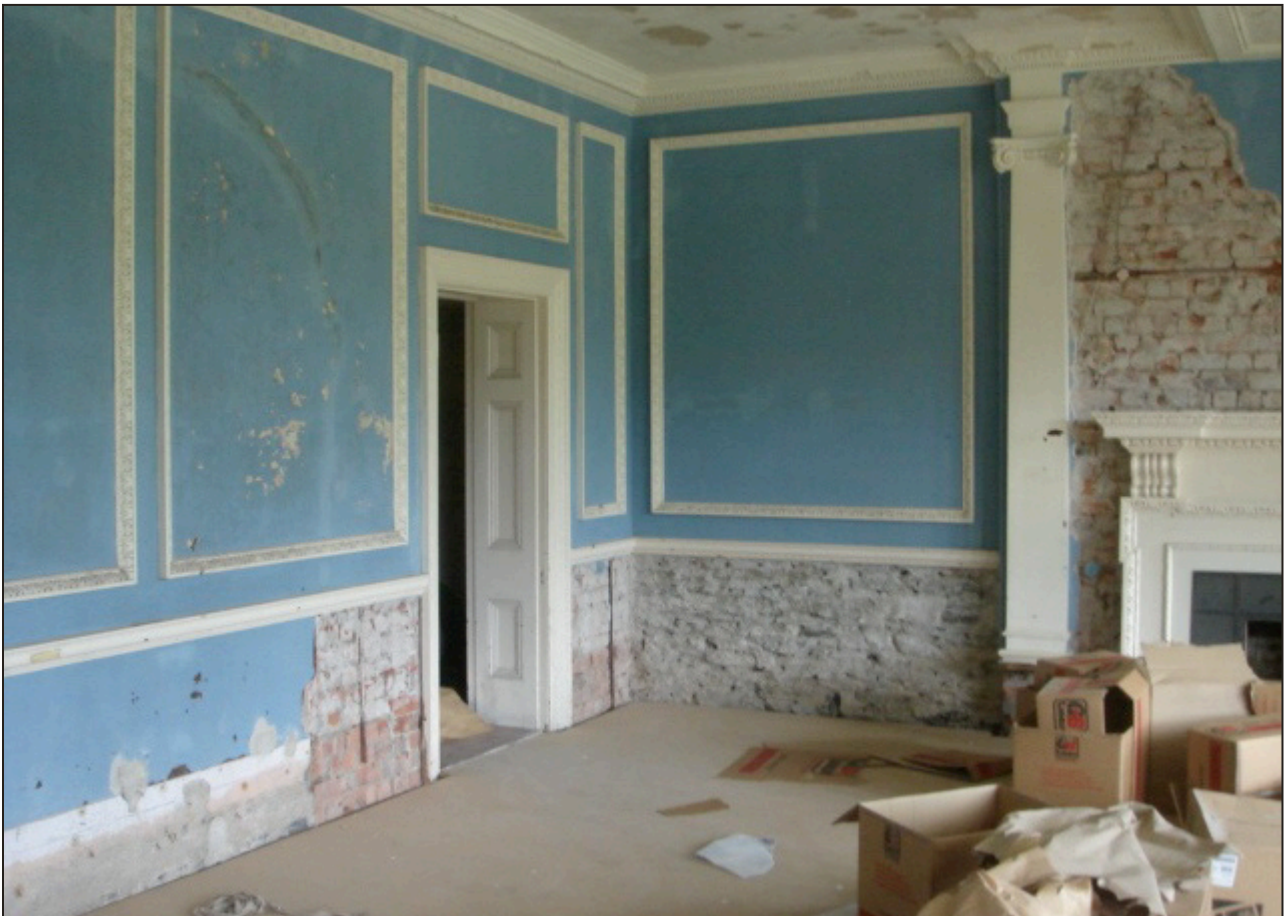
LEFT: the Dining Room where the painting of Edward VIII will hang.