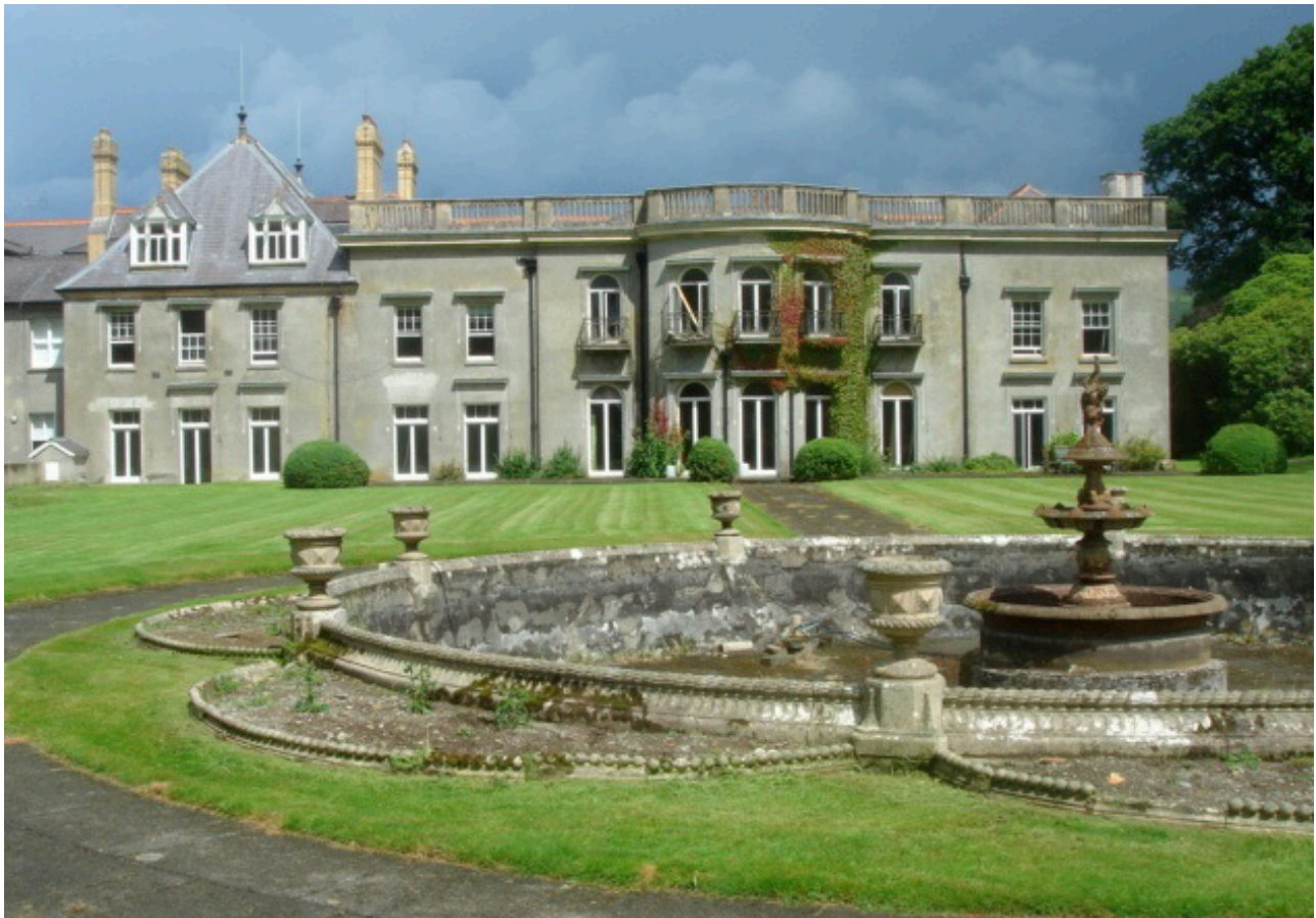
LEFT: exterior view of Trawscoed Mansion.