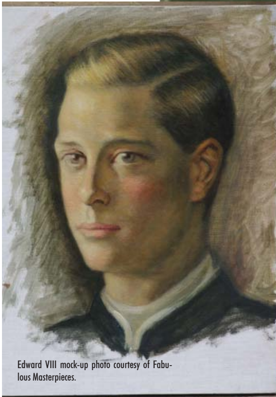
Edward VIII mock-up

All of these aspects make this particular painting interesting. Perhaps even Edward himself faced this same dilemma—the lack of regalia illustrations with him as the subject. The Duke of Windsor himself had a similar portrait commissioned dressed in the Order of the Garter Robes, albeit in his later years, by artist Sir James Gunn. A photograph of the painting, the duke in his